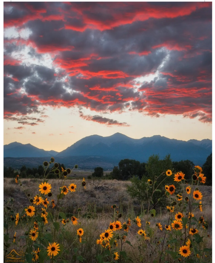
Autumn In the Rockies