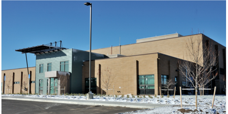
This is ACWWA's Joint Water Purification Plant near Bronco Parkway and Jordan Road that'll send us bottled-water quality H2O.

That's the good news from the Arapahoe County Water and Wastewater Authority, which was not bashful about passing along this kind of news at its annual open house in October.