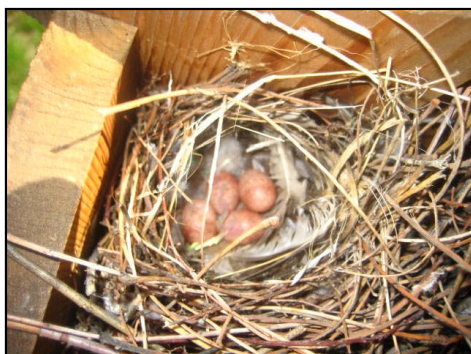
House Wren eggs

This little lady has set up house-keeping in the bush in front of The Race's house on Maplewood