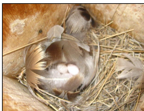
Tree Swallow eggs