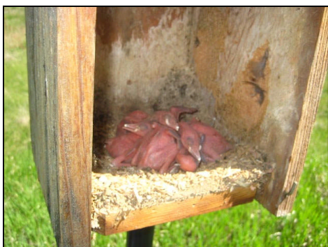
Newly hatched Flicker chicks

This year is seeing a late start for our bird population at Sanctuary on the Park . In discussions with other groups that seems to be the case everywhere in the area. The wet cold Spring is blamed. We do have some activity, though, and here are some pictures we took on Clean Up Day, May 30th.